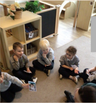
An exciting week of phonics