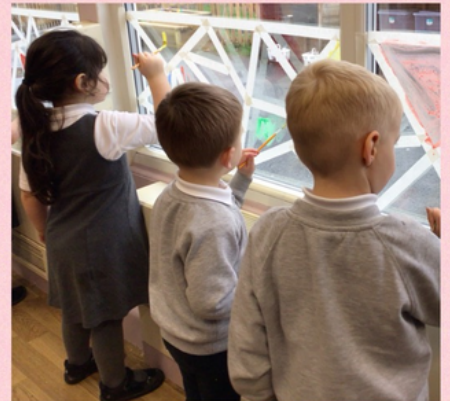
We hope you like our painted windows!