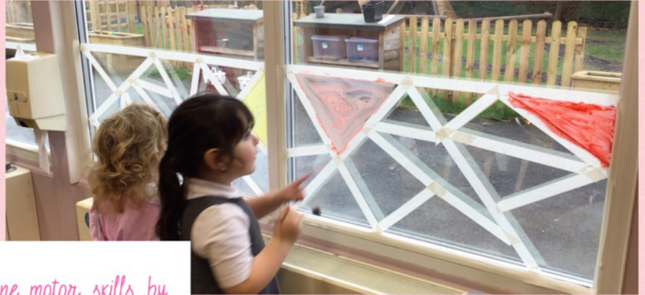
We developed our fine motor skills by painting inside the shapes.