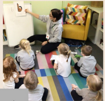
Learning new sounds