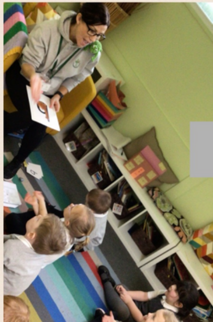
Using stories to create sounds