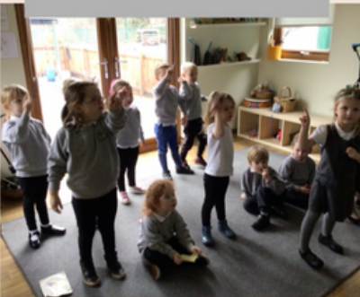
Forming letters in the air