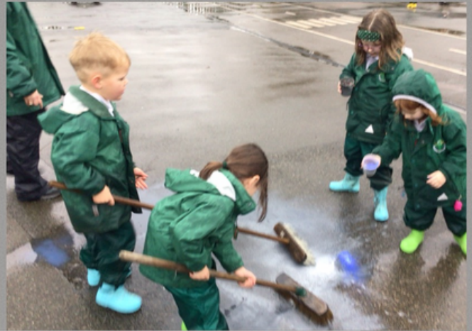
Making winter puddles in the rain. Adding white and black to make them lighter and darker!