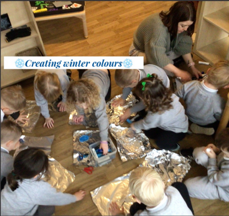
❄️ Creating winter colours ❄️