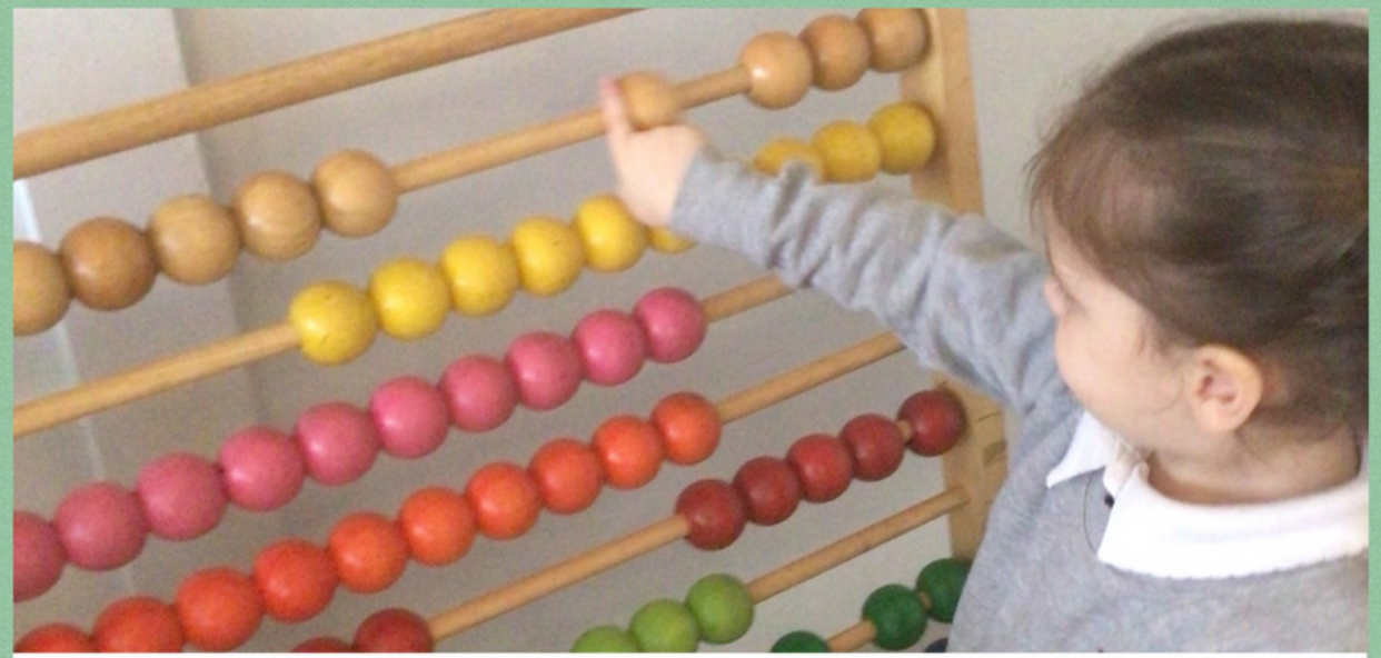
Our number of the week is 10 so we went on a number hunt to see if we could find 10!