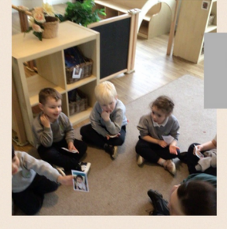
An exciting week of phonics