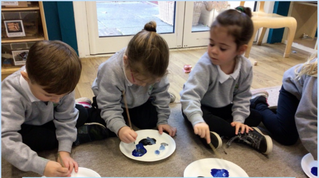
Creating winter colours. We added white to make it lighter and Black to make it darker.